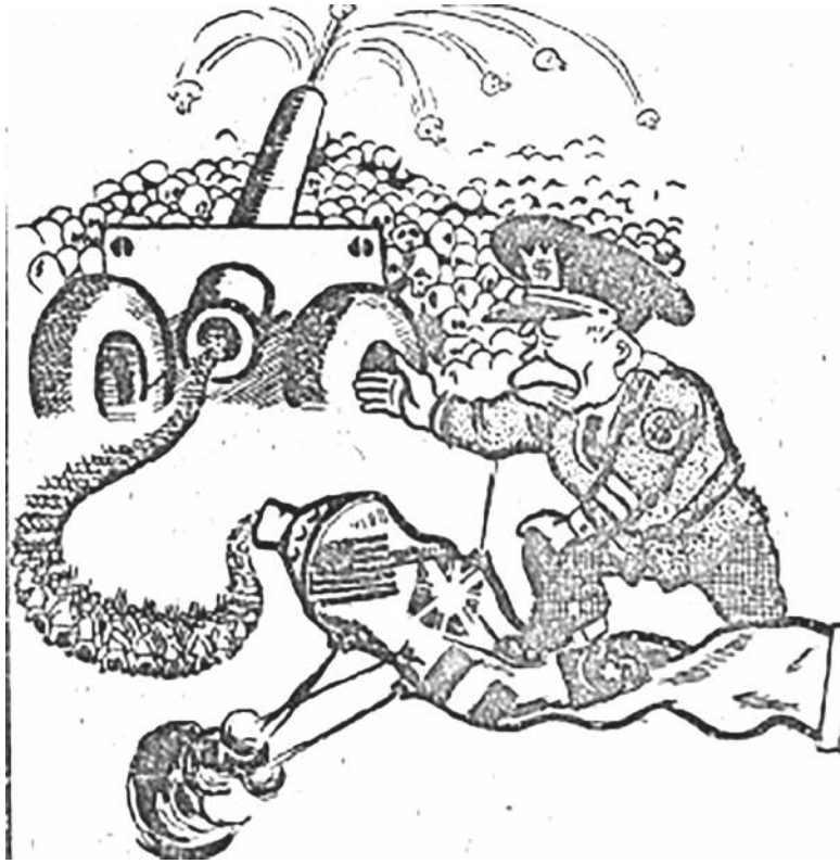
A leaflet distributed in Korea during the war. It shows UN troops being squeezed out of a toothpaste tube and into a cannon where they are fired northward.