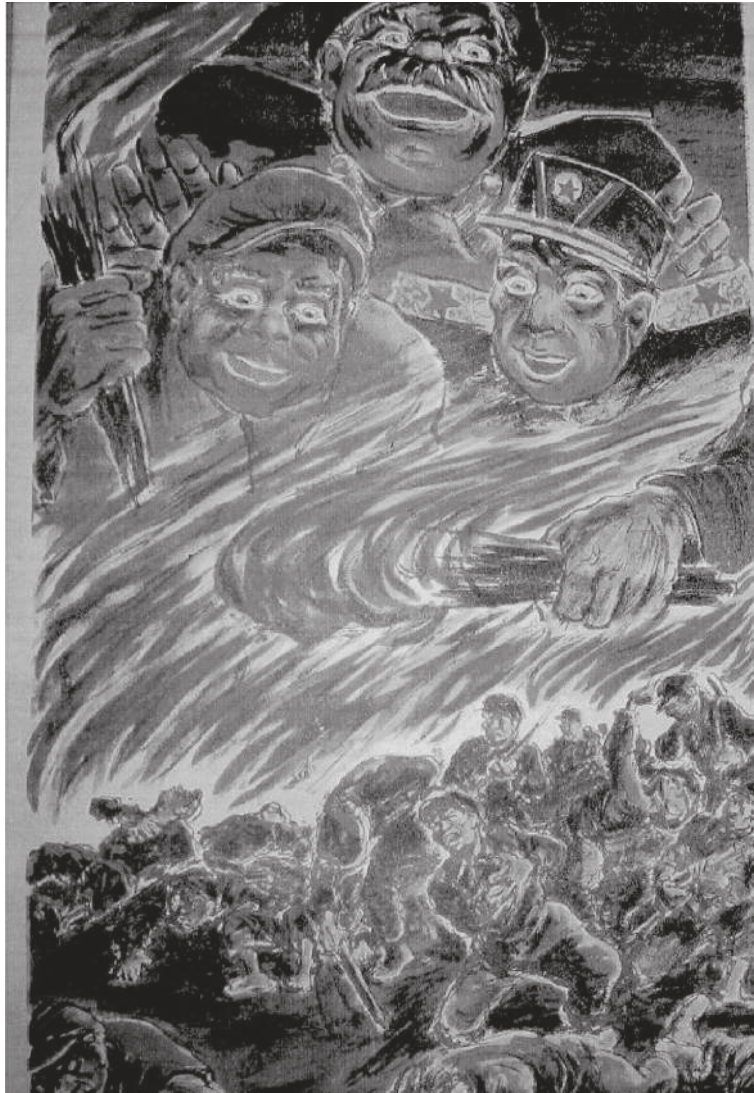
A leaflet distributed in Korea during the war. The figures at the top represent Mao Zedong, Stalin and Kim Il-sung. Kim Il-sung was the Prime Minister of North Korea.